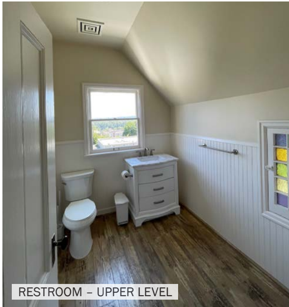
RESTROOM - UPPER LEVEL