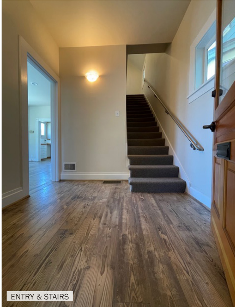
ENTRY & STAIRS