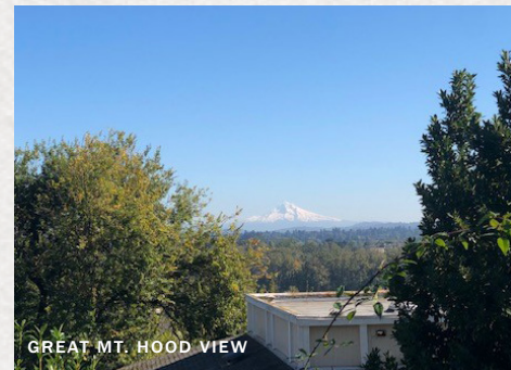
GREAT MT. HOOD VIEW