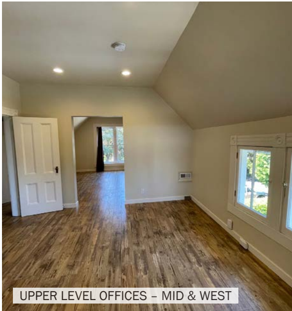
UPPER LEVEL OFFICES - MID & WEST