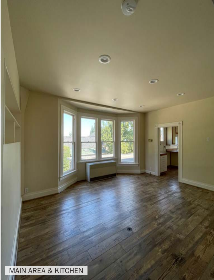
MAIN AREA & KITCHEN