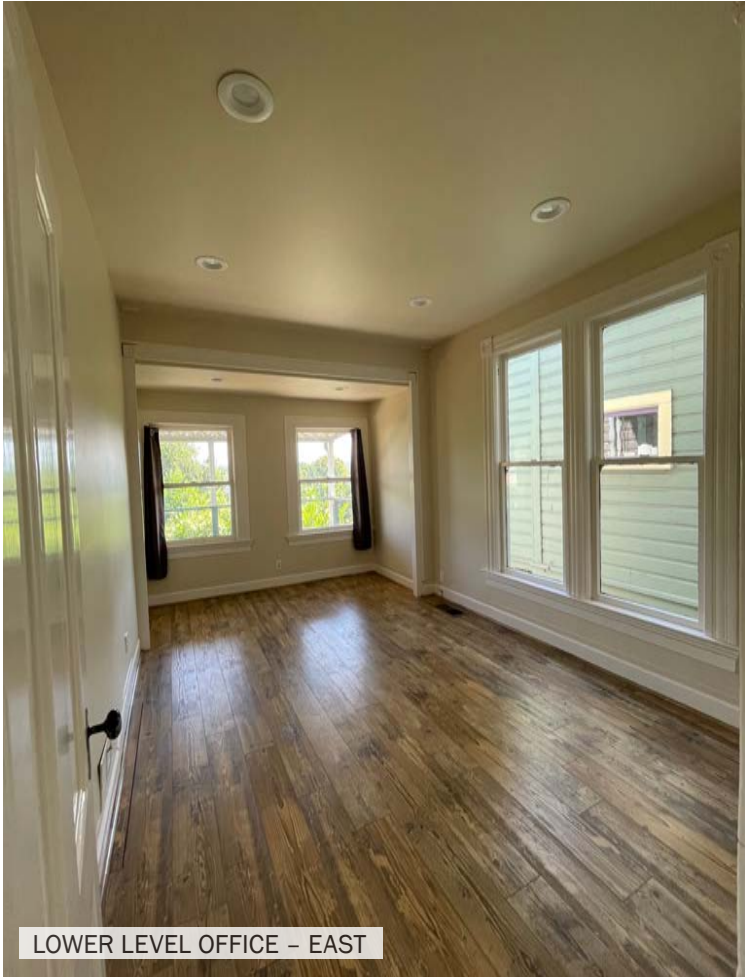
LOWER LEVEL OFFICE - EAST