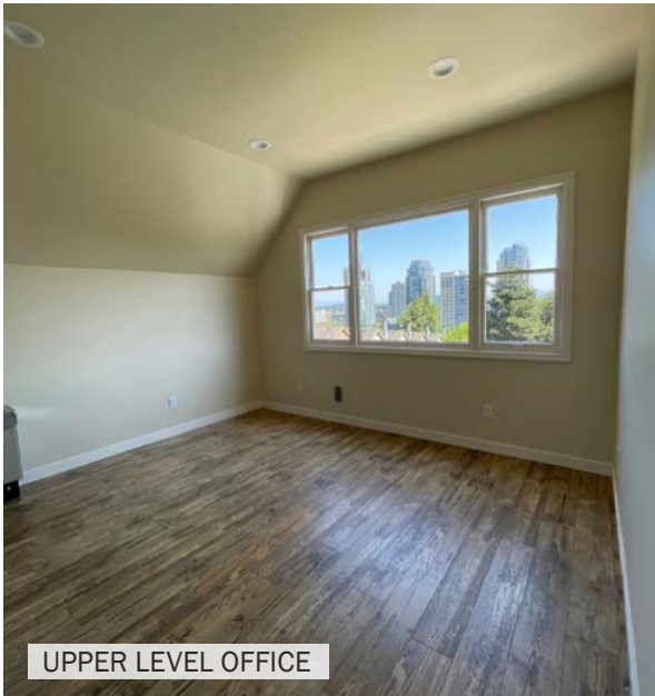
UPPER LEVEL OFFICE