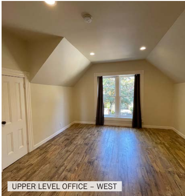
UPPER LEVEL OFFICE - WEST